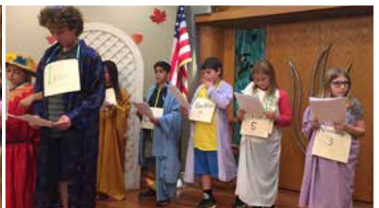
Shabbat B'Yachad play