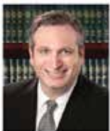
ATTORNEY AT LAW "20 years Experience"

FAMILY LAW COMMERCIAL LITIGATION FREE 30 MIN. CONSULTATION