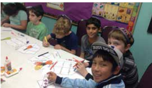
Making Torah value shields