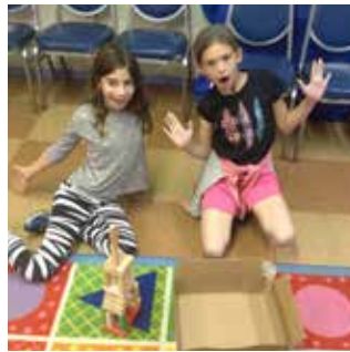
Ohr L'Olam Tzedakah program