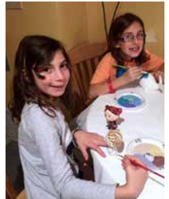
Kadima was busy creating masterpieces at Color Me Mine