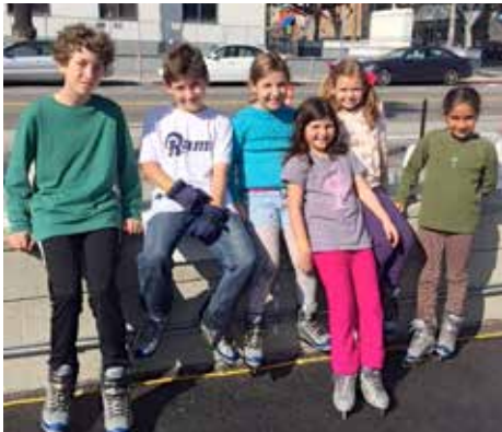
Enjoying "The Ice"

Get ready for more fun and save the date for our next event on Sunday, March 8 after Religious School.