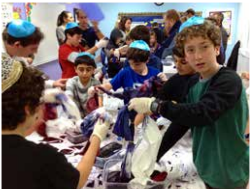
5th-7th Grade B'nai Mitzvah program making tie-dye Tallitot