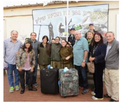
Delivering care packages made by KM students to soliders