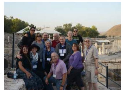
Visiting Beit Shean