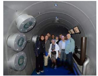
Waste water treatment plant

Highlights of the trip included a visit to an army base in Ashkelon where we met with young IDF soldiers and presented them with gifts from our religious school as well as hip clothing for the women. A double rainbow made it even more special. They were so appreciative that if the delivery was all we did, it would have been enough. I can't wait to return.