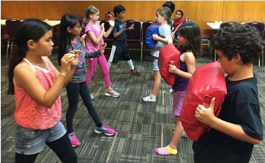
Students gearing up for some Krav Maga.