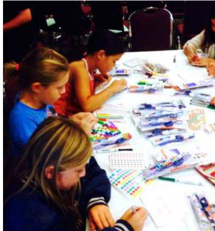
Our students working on their Ohr L'Olam project, making care packages and writing notes for Israeli soldiers to be hand-delivered during our solidarity mission to Israel.