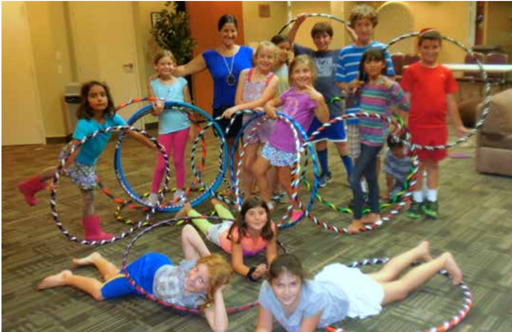
Kadima Kids with their hula hoops enjoying "Hoopnotica." See page 5 for more pictures.