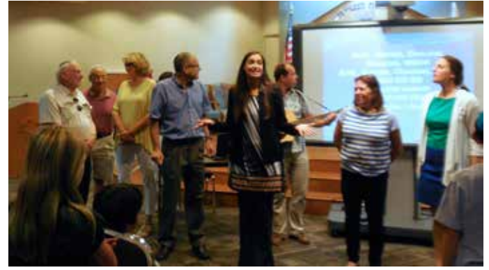
First day of Religious School followed by a Kadima event: "Hoopnotical!"